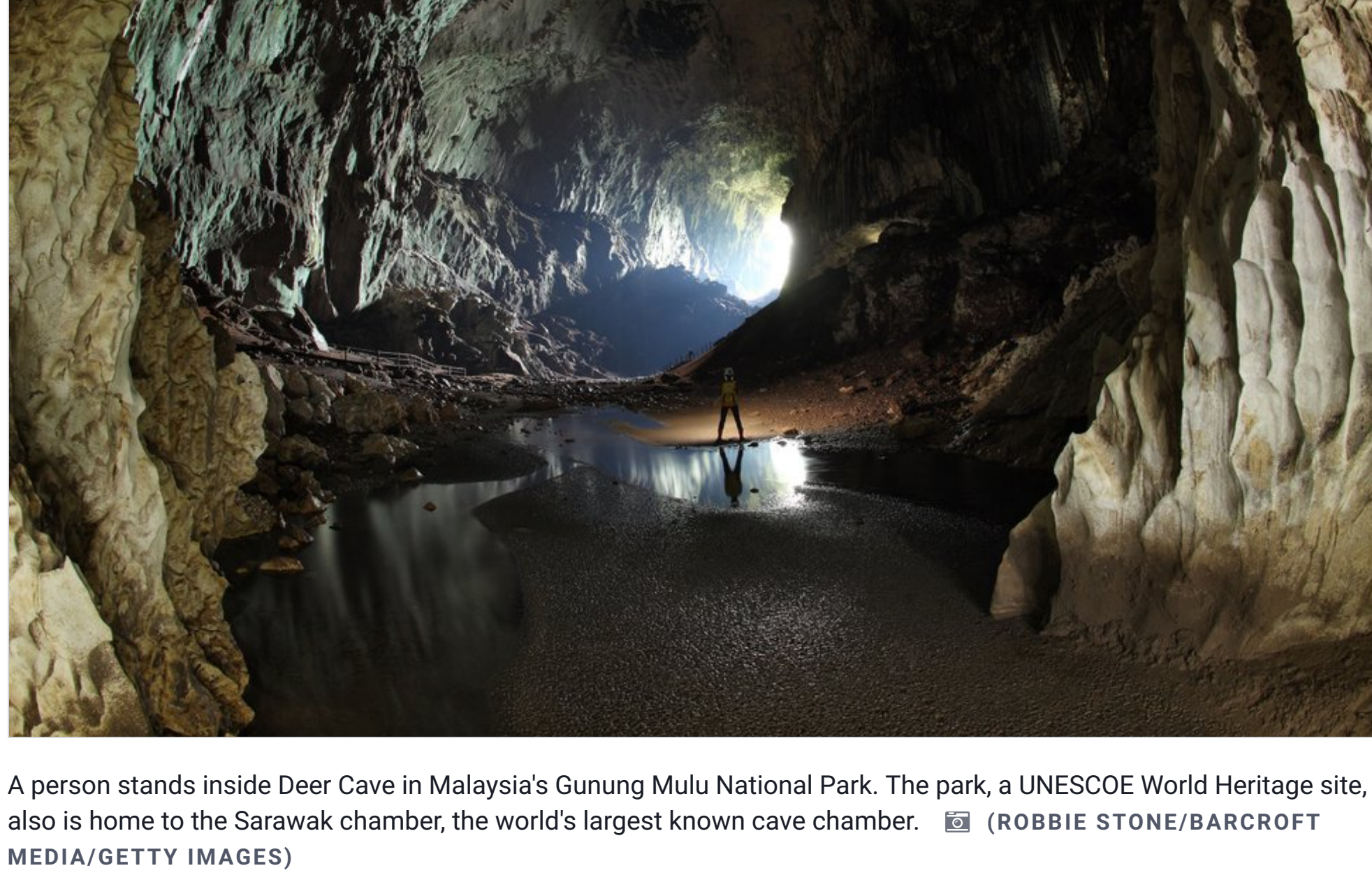
A person stands inside Deer Cave in Malaysia's Gunung Mulu National Park. The park, a UNESCO World Heritage site, also is home to the Sarawak chamber, the world's largest known cave chamber.

Malaysia is a small country with a fast-growing economy. Located on a trade route in the South China Sea, the Southeast Asian country has an open, diversified, upper-middle income economy.